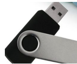
USB 5 850