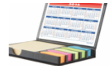
Sticky Note Pad- 5 325