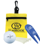
Golf Tool Set- 5 500