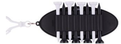
Golf Tees Set- 5 400