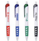
Pens- 5 225