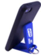
KeyChainPhone Holder- 5 250