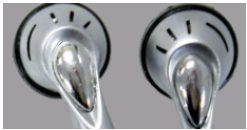
Ear Buds- 5 375