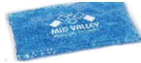
Ice Pack- 5 500